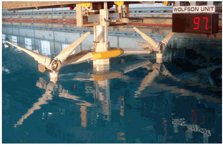
Marine Current Turbines (MCT) model testing

Wolfson Unit engineers can quickly make theoretical calculations and design suggestions based upon experience and fundamental fluid dynamic theory, from which more in-depth assessments and analysis can be made.